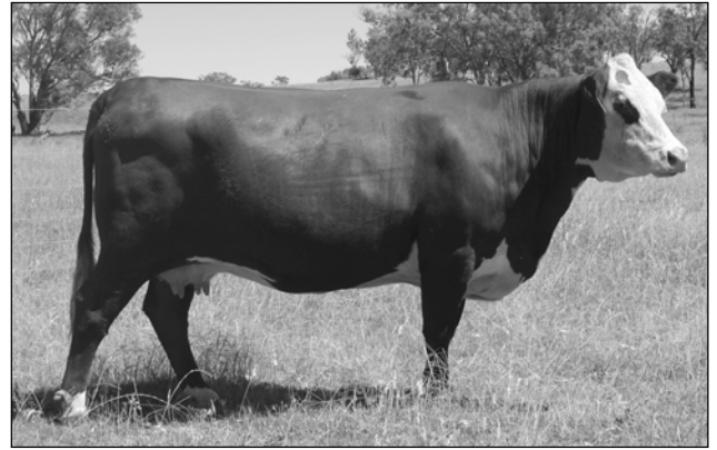
DAM: BOWEN KATIE G100 (AI) (P)

KOANUI ROCKET Q334 (P) KOANUI ROCKET 0219 (IMP NZL) (P) KOANUI ANGEL R187 (P) DAM: BOWEN KATIE G100 (AI) (P) BOWEN ARGYLE A355 (AI) (S) BOWEN KATIE D236 (P) BOWEN KATIE A336 (P)