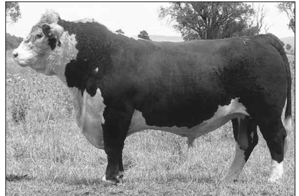
SIRE: BOWEN COWBOY C245 (AI) (ET) (P)

BOWEN TORNADO Z260 (AI) (ET) (P) RILO PARK UNSHAKEABLE (AI) (ET) (P) BOWEN MATCHLESS L140 (AI) (P) DAM: BOWEN FANCY E94 (AI) (P) KENYA KIDMAN (P) BOWEN FANCY X57 (AI) (P) BOWEN FANCY U2791 (AI) (P)