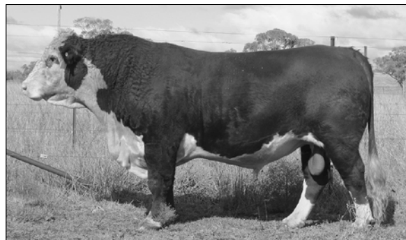
SIRE: YAVENVALE JET FIRE J032 (P)

DR TRANSCENDENT (IMP USA) (IMP USA) (P) BOWEN MATCHLESS Z152 (AI) (P) BOWEN MATCHLESS W406 (AI) (ET) (P)