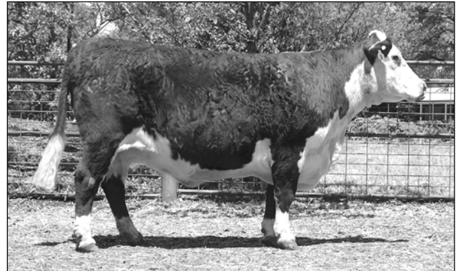
GRAND DAM: BOWEN FANCY X57 (AI) (P)

ALLENDALE NATIONAL W168 (P) BOWEN DIAMANTINA D203 (AI) (P) BOWEN MATCHLESS Z152 (AI) (P) SIRE: BOWEN HANLEY H92 (P) BOWEN ARGYLE A355 (AI) (S) PEAKES VICTORIA LASS D201 (P) AMOR VICTORIA LASS A157 (P) HARVIE RAFTSMAN 16R (IMP CAN) (P) MAUNGAHINA KINGDOM BAY 070073 (IMP NZL) (P) MAUNGAHINA MODESTY T264 (P) DAM: BOWEN FANCY G196 (AI) (ET) (P) KENYA KIDMAN (P) BOWEN FANCY X57 (AI) (P) BOWEN FANCY U2791 (AI) (P)