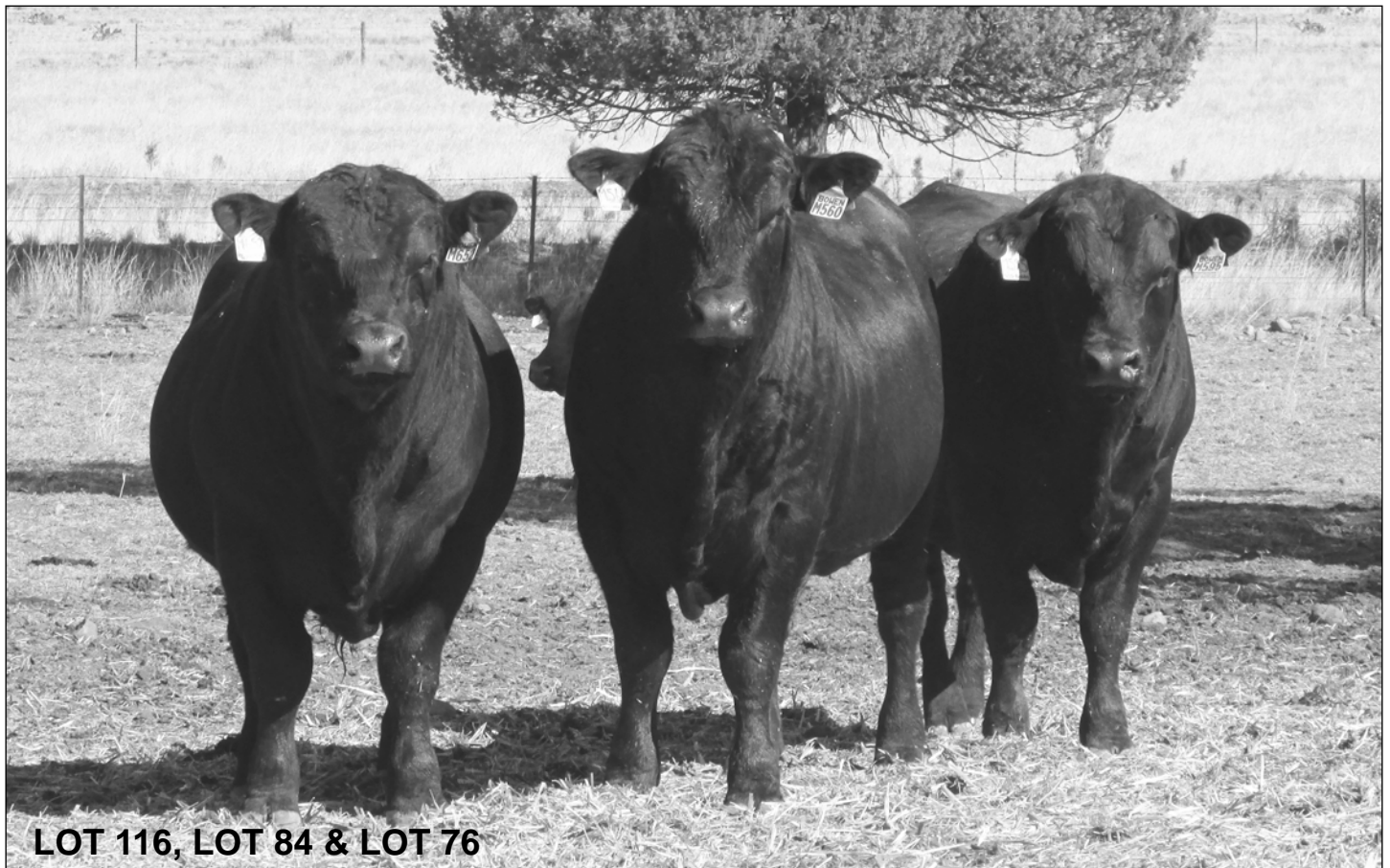
LOT 116, LOT 84 & LOT 76