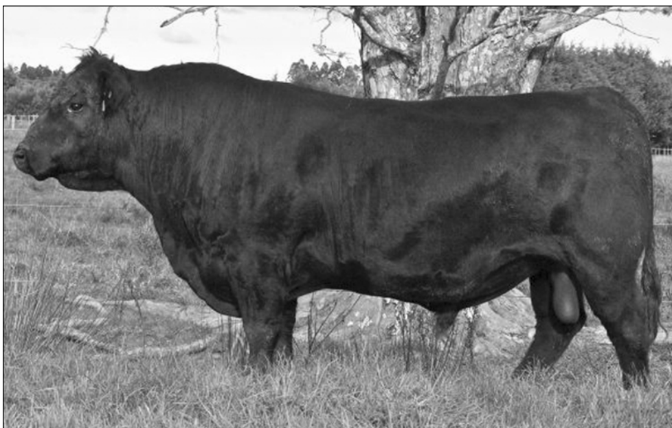
Matauri Reality 839 Sire of Lots 71, 75, 76, 89, 109, 111 & 122.