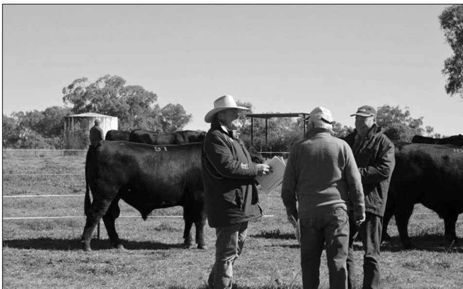
Bowen 2017 Bull Sale