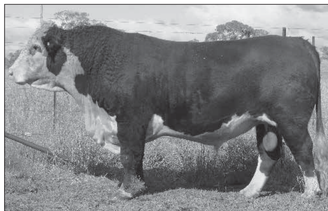
SIRE: YAVENVALE JET FIRE J032 (PP)

ALLENDALE OCTAGONAL (AI) (P) BOWEN MATCHLESS Y195 (P) BOWEN MATCHLESS V15 (AI) (P)