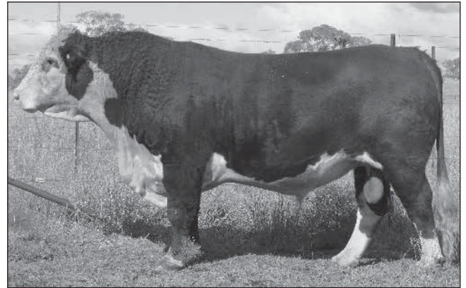
SIRE: YAVENVALE JET FIRE J032 (PP)

BOWEN TORNADO Z260 (AI) (ET) (PP) BOWEN HARMONY E190 (P) BOWEN HARMONY B279 (H)