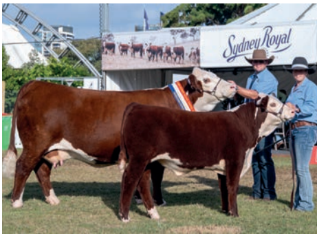
Pictured Kianma Matchless R010.